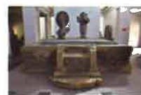
My Son E1 Altar