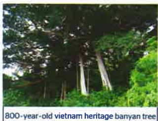
800-year-old vietnam heritage banyan tree

Just 10 km from Da Nang city center to the Northeast, Son Tra Peninsula called "A jungle in the young city" is National Nature Reserve Zone which is put under the national regime of the forbidden forest. The Peninsula is famous for its richness in ecological categories of fauna and flora, including many rare animals. Linh Ung pagoda in Son Tra peninsula is considered as one of the biggest pagodas in Da Nang city with the highest Guan Yin statue in Vietnam.