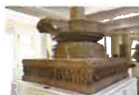
Tra Kieu Altar