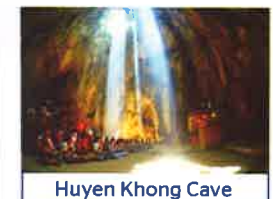
Huyen Khong Cave

Located 7 km to the southeast of Da Nang city center, the Marble Mountains consist of five mountains: Kim Son (Metal), Moc Son (Wood), Thuy Son (Water), Hoa Son (Fire), Tho Son (Soil). With good terrain and charming landscape, the Marble Mountains have a great attraction for spiritual tourism. Especially the Avalokitesvara Festival held annually on 19/2 lunar month attracts many visitors on pilgrimage.