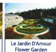
Le Jardin D'Amour Flower Garden