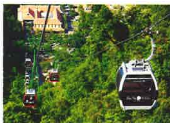
Ba Na's Cable Car System - 4 Guinness Records

Located 25 km to the southwest of Da Nang at an altitude of 1,487m, Ba Na Hills is considered as "A temperate hideout in the tropical forest" for the cool climate around the year. Tourists may enjoy four seasons within one day.