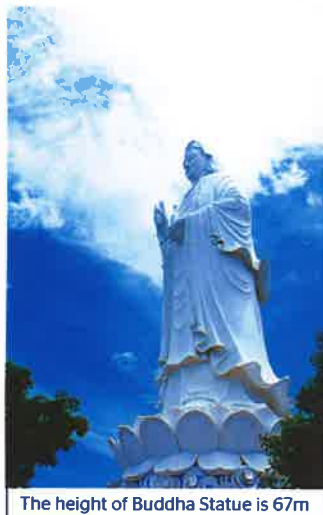
The height of Buddha Statue is 67m